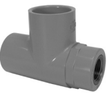
5014R-S-BI Sprinkler Head Tee w/ Metal Thread Insert (S X FNPT X S)