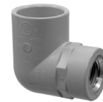
5007-3S-BT BRASTIC® Sprinkler Head 90 w/ Metal Starter Thread (S X FNPT)