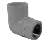
5007-3-S-BI Sprinkler Head 90 w/ Metal Thread Insert (S X FNPT)