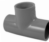
5011 Tee (S x S x S)