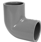
5007 90° Elbow (S x S)